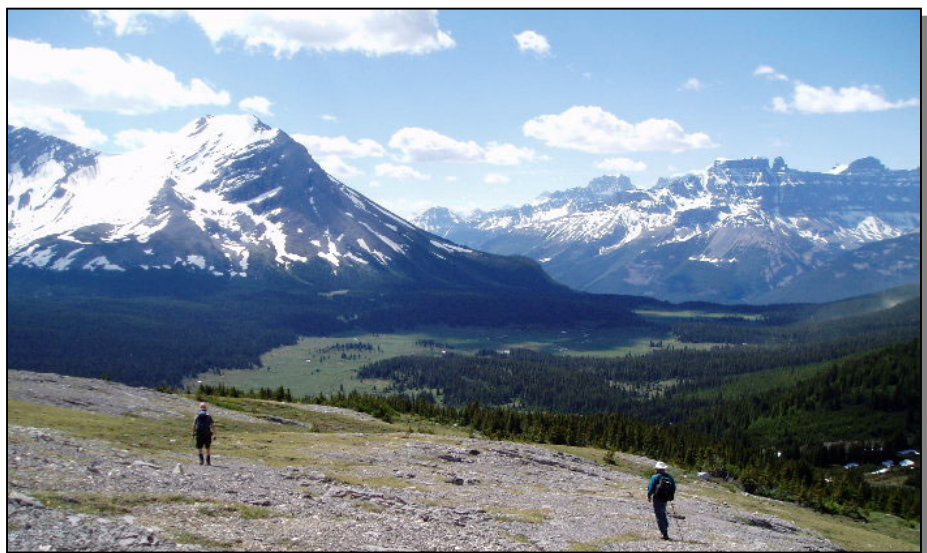
Sunset Pass – location of camp

Picture yourself hiking in a remote setting catching glimpses of glaciers, waterfalls and clear mountain streams. Think of the wonderful vistas available in the back country,