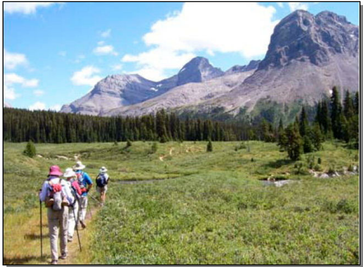
Sunset Pass meadow – location of camp

What We Offer : It has been described as "backpacking without the backpack." We offer