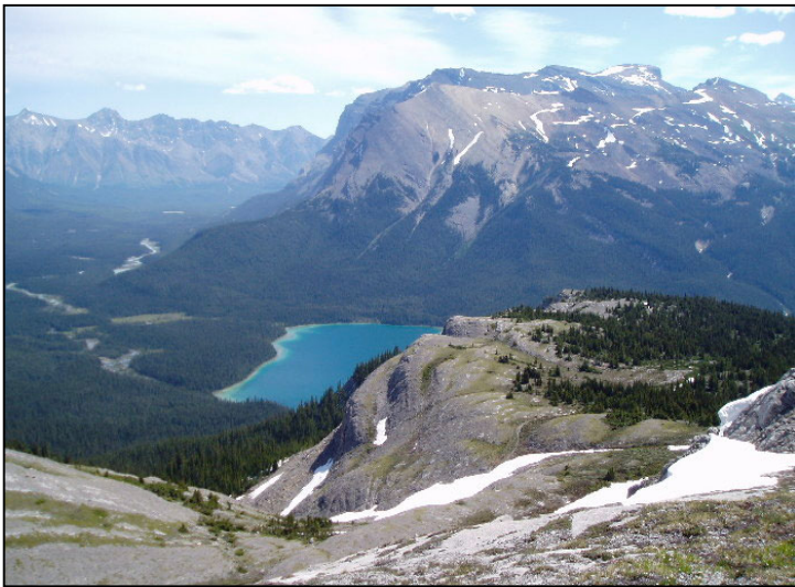
Pinto Lake seen from Summit of Sunset Pass

The Hike into camp will follow a 8.0 kilometre route, the first four of which is a steady upward climb of some 500 metres in elevation gain. The last 4 kilometres into